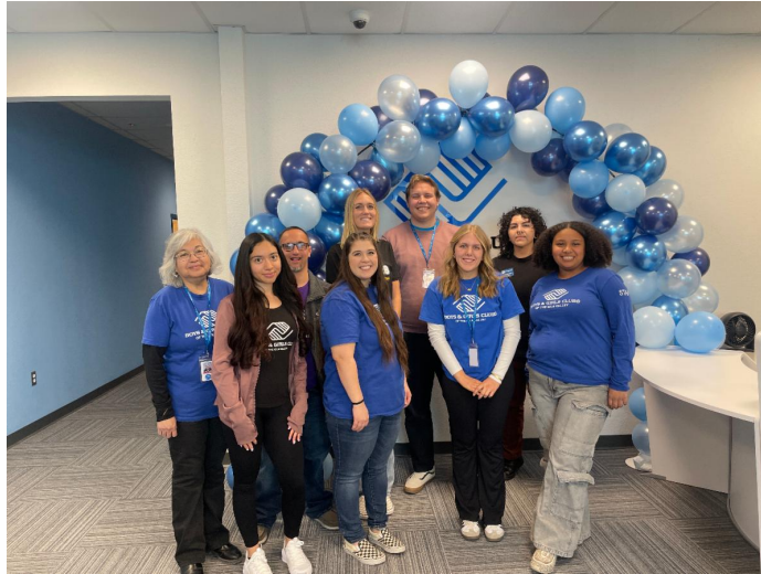
Boys & Girls Clubs of the Gila Valley staff participates in Orientation and Training

With enthusiasm and excitement, the staff from the Boys & Girls Clubs of the Gila Valley recently joined the Boys & Girls Clubs of Tucson for an engaging orientation and training session. During the event, staff members were introduced to the organization's policies and procedures, fostering collaboration and strengthening the network of support for our newest club.