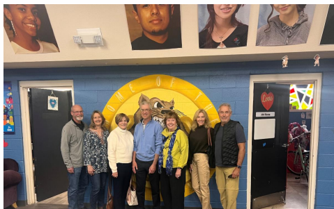
A Heartfelt Thank You to the Stone Canyon Foundation!

We were honored to welcome the Stone Canyon Foundation to our Steve Daru Clubhouse! Their visit gave us the perfect opportunity to showcase the incredible impact their support has on our community.